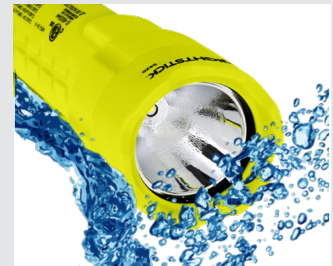
Durable polymer body is impact & chemical resistant