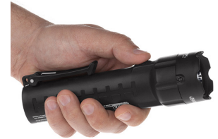
Large, textured button